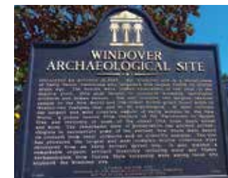
Look for the Marker on-site

The site contains the largest skeletal sample in the New World and the oldest bottle gourd found north of Mexico. It also