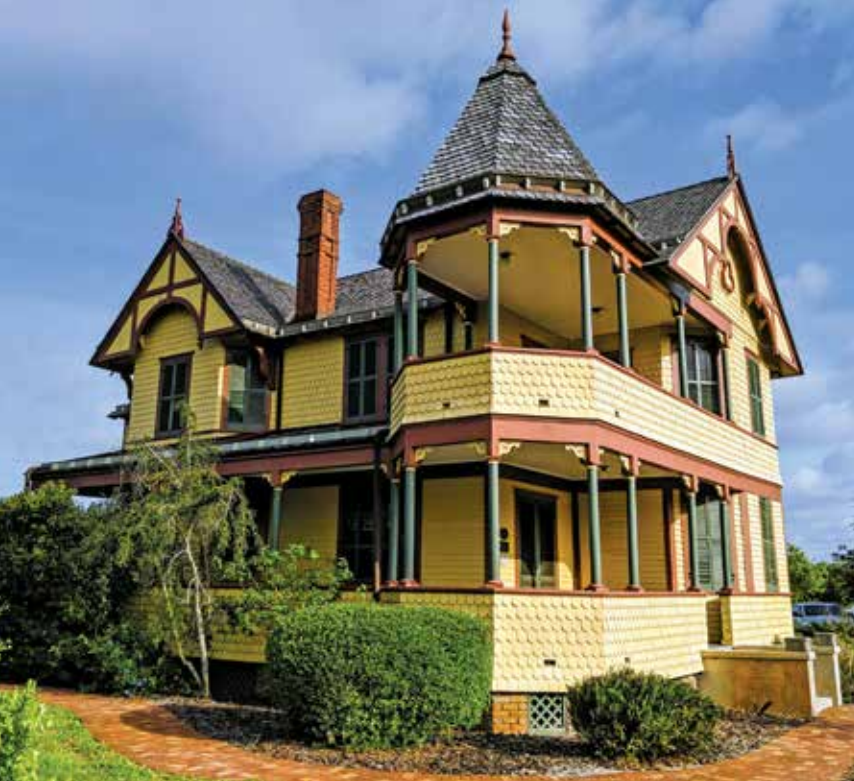
The Pritchard House was placed on the National Register of Historic Places in 1990.