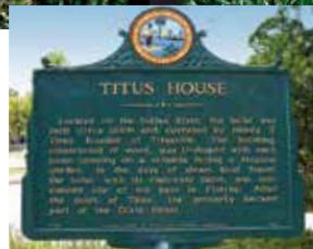
Look for the Marker on-site