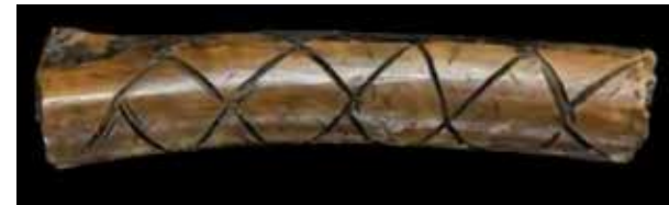
Windover Artifact This incised bird bone tube is one of five from the Windover Archaeological Site. Decoration could have been achieved using a shark tooth or chert engraving tool and was likely associated with female burials. The bone is now on display at the Brevard Museum of History & Natural Science located at 2201 Michigan Ave., Cocoa, FL.

Located at: 506 South Palm Ave, Titusville, FL 32780