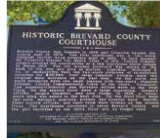
Look for the Marker on-site