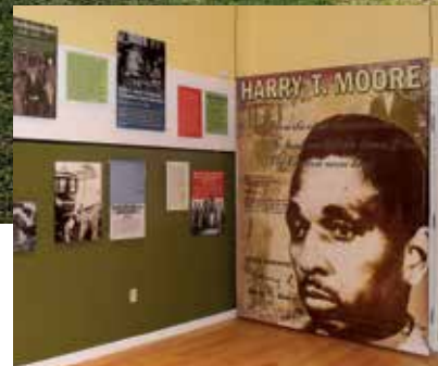
The Harry T. & Harriet V. Cultural Complex, co-located with the The Harry T. & Harriet V. Moore Memorial Homesite, provides historical context and honors the memory of these civil rights activists.

Located at: 1635 North Old Dixie Highway, Titusville, FL 32780