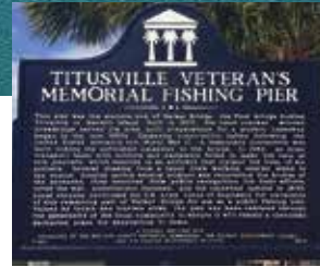
Look for the Marker on-site