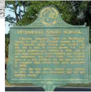
Look for the Marker on-site